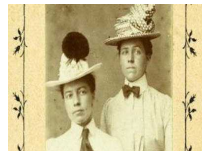
Alice Austen House Designated National Site of LGBTQ History