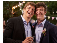
Is Marriage Equality a Boon for the Housing Market?