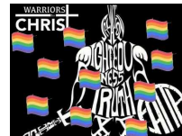
Anti-LGBT 'Christian' Group's Facebook Page Gets Punked by Rainbow Flags