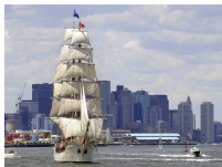
They're Shipping In: Boston Hosts More Than 50 Tall Ships